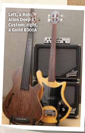
Left, a Rob Allen Deep 5 Custom; right, a Guild B301A