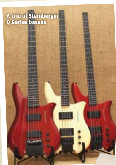
A trio of Steinberger Q Series basses

'Working with great musicians, touring the world – and eating well, which is another passion of mine – it's not a bad job. And there's always time to keep a sharp eye out for unusual basses, an addiction that's fine for my health but detrimental to my wealth!' 🎸