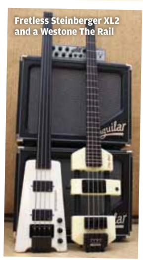
Fretless Steinberger XL2 and a Westone The Rail