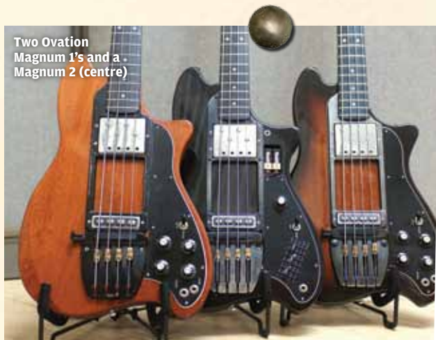
Two Ovation Magnum 1's and a Magnum 2 (centre)