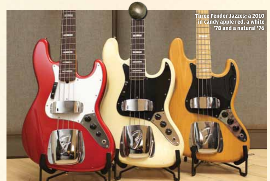
Three Fender Jazzes; a 2010 in candy apple red, a white '78 and a natural '76

As so much of the music Dave is called upon to play is roots-orientated, from blues to boogie to soul, funk and jazz, Fenders are a