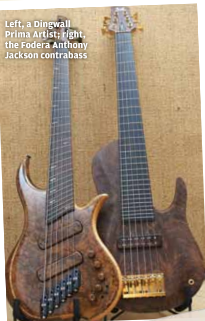
Left, a Dingwall Prima Artist; right, the Fodera Anthony Jackson contrabass