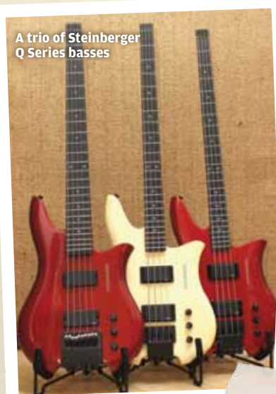
A trio of Steinberger Q Series basses

'Working with great musicians, touring the world – and eating well, which is another passion of mine – it's not a bad job. And there's always time to keep a sharp eye out for unusual basses, an addiction that's fine for my health but detrimental to my wealth! 🎸