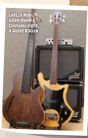
Left, a Rob Allen Deep 5 Custom; right, a Guild B301A