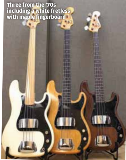
Three from the '70s including a white fretless with maple fingerboard